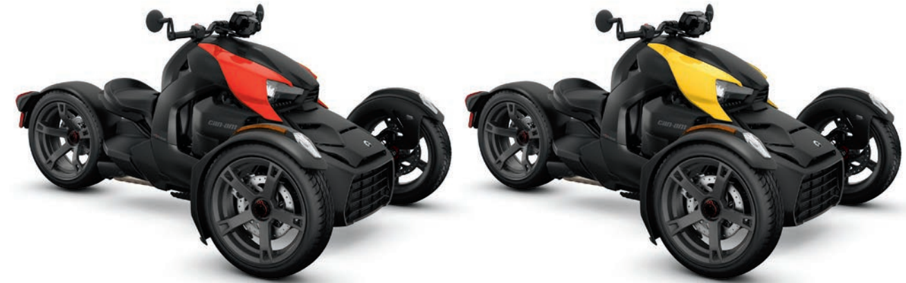
Units shown with Classic Series panel kits.